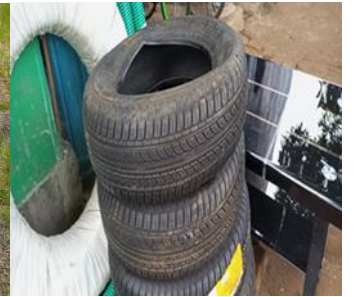
One of the tires was bought