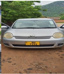
Heavenly doors were open!