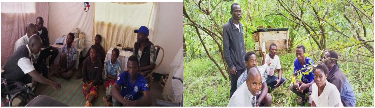
The group prays when they meet. They learn Humility Bee keeping is another source of income