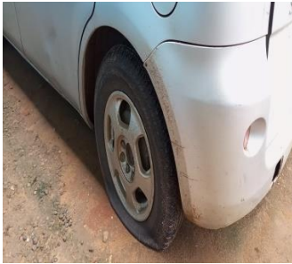
The tire was Broken