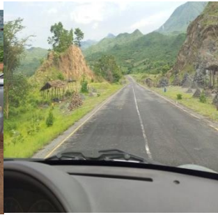
The road was open for us!