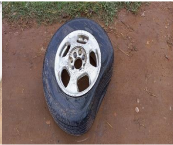
It was untighten