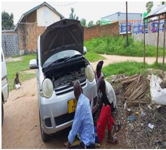
Men did the job!