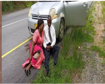
When we said God help us