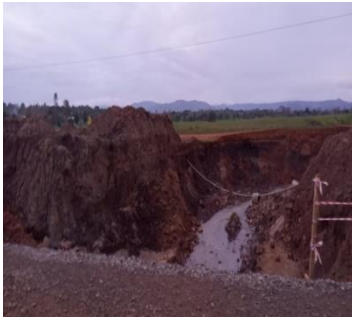
The Broken Bridge due to heavy rains