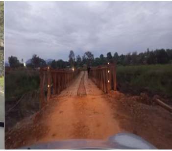
We used the temporary bridge